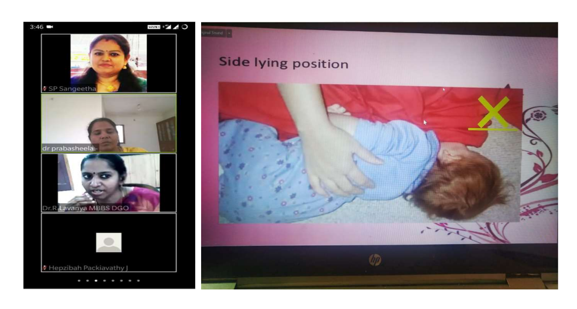
Support breastfeeding for a healthier planet